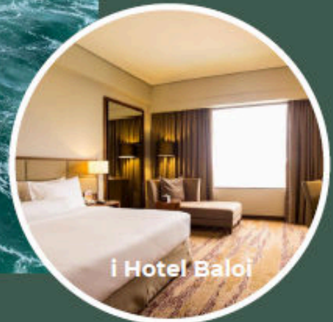
i Hotel Baloi