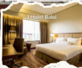
I Hotel Baloi