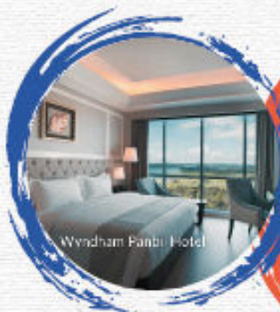
Wyndham Ranoh Hotel