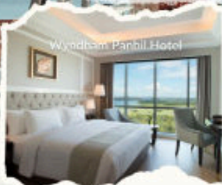
Wyndham Parbil Hotel